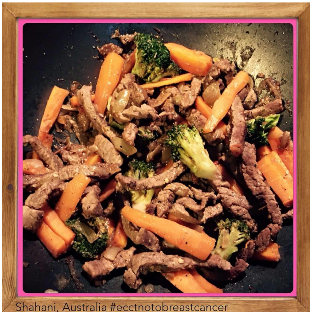
Shahani, Australia #ecctnotobreastcancer

In October, the ECCT asked women worldwide to upload an image of a healthy recipe or record them, or someone else doing any exercise onto the ECCT Facebook page. The proviso was that there must be pink in the image or video, for example a pink table mat, one can wear a pink top etc. to represent Breast Cancer month.