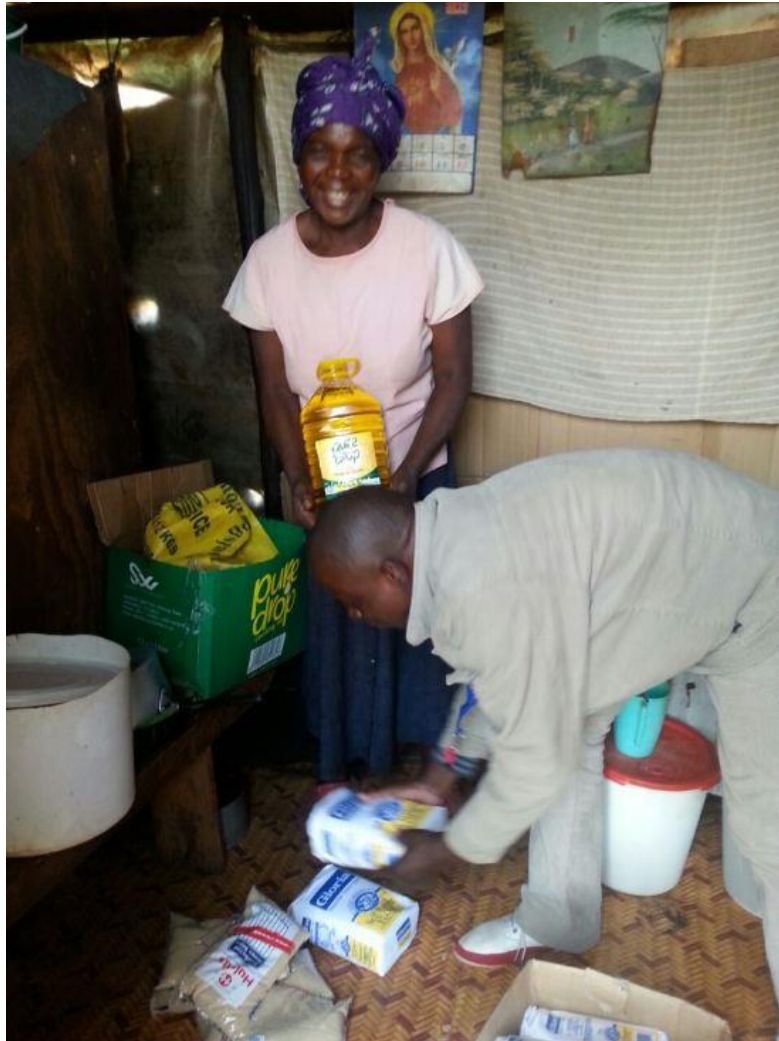
Image: thank you for your donations as they allow us to provide, for example, food hampers to the patients and their families.

During the ECCT FitChicks Global Challenge which happened on the social media outlets Facebook and Instagram - any woman worldwide could join this challenge by either doing one of the exercises someone else posted, or posting her own video challenging any of her friends or other ladies already in the challenge to do it. Anyone participating donated at least $1 to the ECCT.